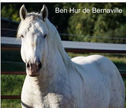
Ben Hur de Bernaville

An estimated 50 breeds of horses and ponies will be on display in the Horse Barn with their owners/trainers and participate where appropriate in the daily Parade of Breeds, breed demonstrations and stallion review. A new breed at Expo this year will be the Boulonnais . See Ben Hur de Bernaville, a five year old stallion, reportedly the first Boulonnais to step on American soil in 115 years in the Horse Barn at Expo 2016.